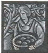
Cosechando (frutas y verduras)