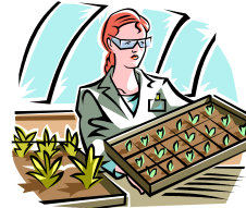
Greenhouse, Nursery, Sod