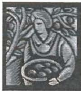
Cosechando (frutas y verduras)