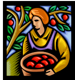
Harvest (fruit and vegetables)