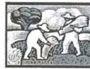
Cultivando, Preparación de Tierra