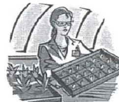
Invernadero, vivero, Cultivar Pasto

----- Padres/Guardianes Nombres Trabajo presente/posición de Trabajo Ultimo Trabajo